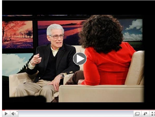
Dr. Brian Weiss on Connecting with Your Everyday Angels - Super Soul Sunday - Oprah Winfrey Network

acknowledges Dr. Weiss, "Love doesn't end with the death of the physical body," no matter whether we're talking about a human or animal member of our family.